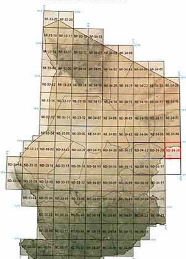
Tableau des feuilles au 1:200000

Citation information for the map, including the title, scale, and authors.